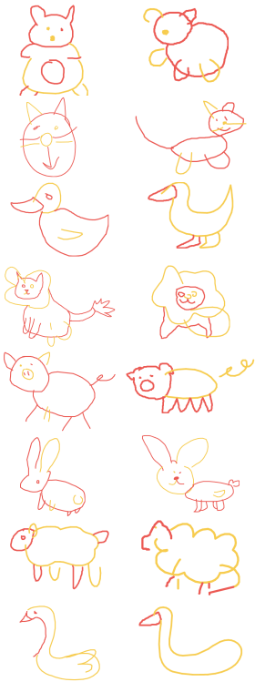
Figure 1: Example sketches produced collaboratively by humans and artificial neural network model. Red strokes produced by humans; yellow strokes produced by model.